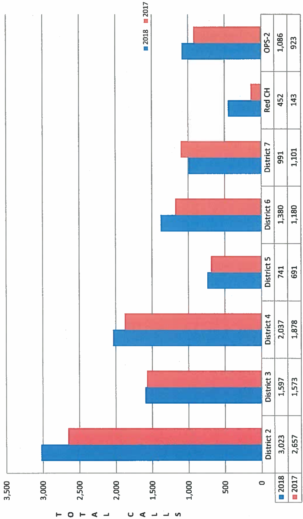
GRAPH B: DISTRICT CHIEFS